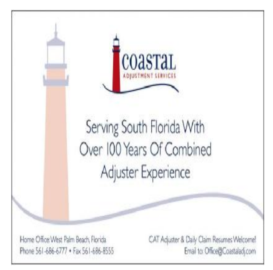
Coastal Adjustment Ad

Haag Engineering Co. HSA Engineers & Scientists I TEL Laboratories, Inc. OnLine Reporting, Inc. PuroClean RJMW Claim Services Simsol Software Temporary Accommodations Top Adjuster Xactimate Training Vale Training Solutions